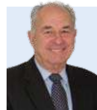
Sir Don McKinnon